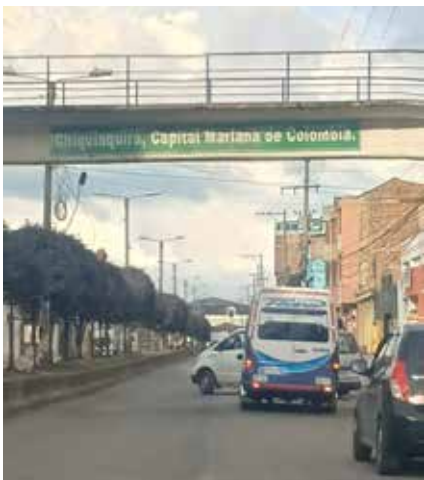
A sign at the only bridge in the town that reads: Chiquinquirá, the Mary Capital of Colombia

Chiquinquirá is a very religious city. They call themselves the Mary Worshipers Capital City. Having the opportunity to openly share the gospel in a place that used to stone Christians has been a major breakthrough. As mentioned earlier, the Novena is also a Catholic tradition, but this time we had the opportunity to use this tradition to help people remember about the greatest gift to the world, Jesus Christ.