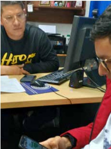
Discssing the latest deatils before the event

Despite unforeseen obstacles, the visit left a lasting impression on the inmates and staff. Many expressed gratitude for the meal, the message, and the opportunity to connect with our team. The positive feedback reaffirmed the importance of this ministry, not only in meeting immediate needs but also in sharing God's love and hope.