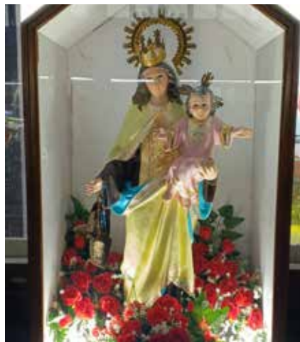
At the bus terminal